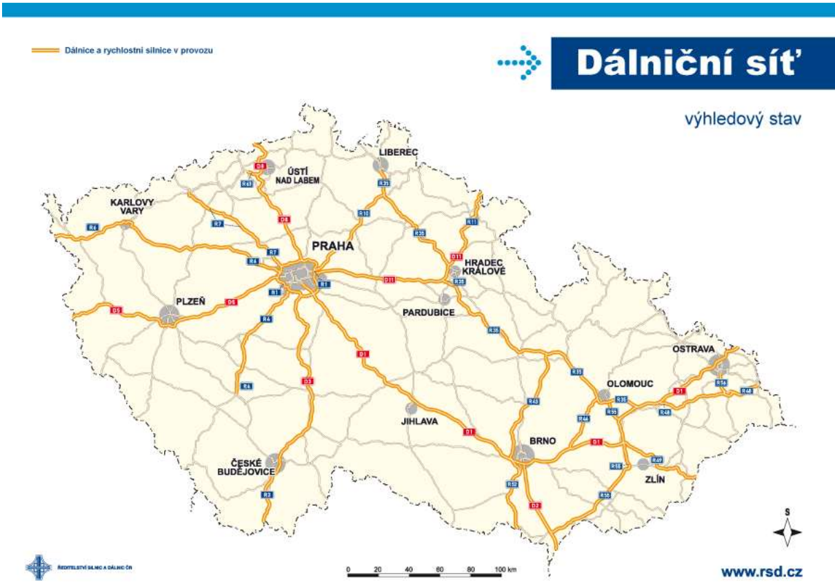
Long-term forecast development of the tolled and non-tolled network in Czech Republic.