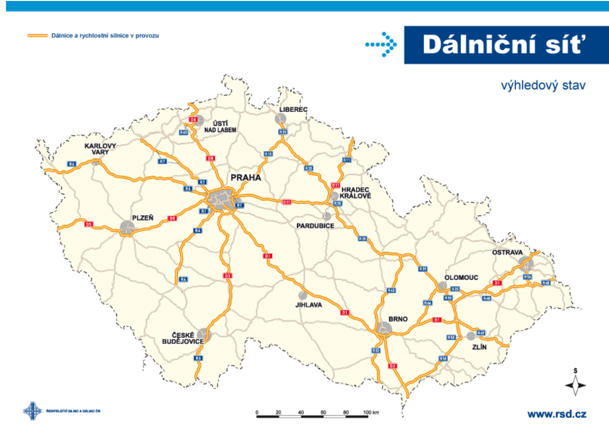
Long-term forecast development of the tolled and non-tolled network in Czech Republic