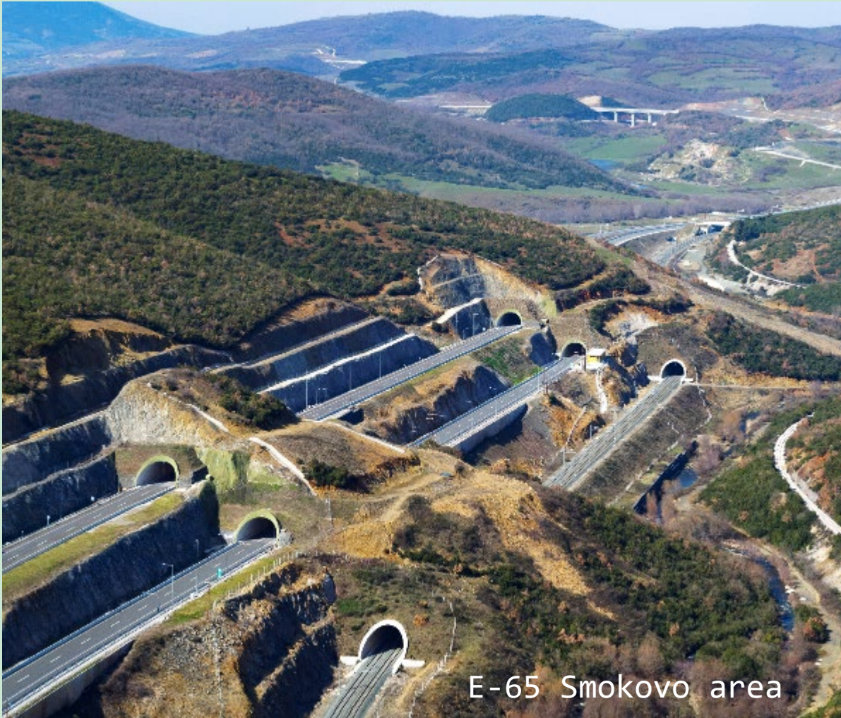
E-65 Smokovo area